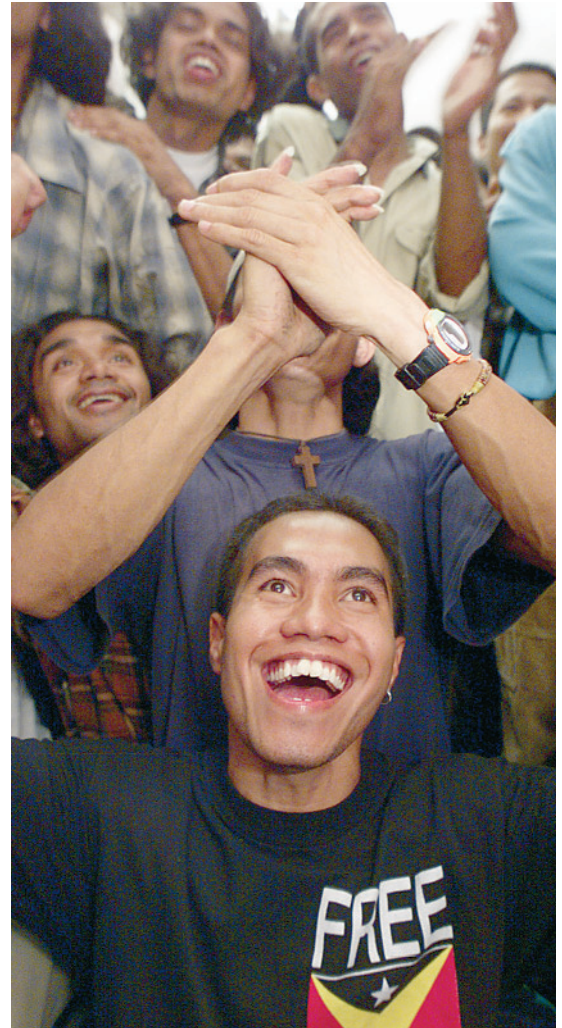
▲ East Timorese celebrate their overwhelming vote for independence in 1999.

As on the Indian subcontinent, violence and struggle were part of the transition in Southeast Asia from colonies to free nations. The same would be true in Africa, where numerous former colonies shed European rule and created independent countries in the wake of World War II.